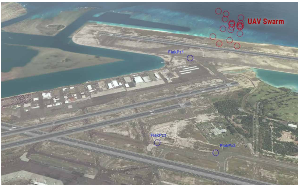
Figure 2: AAA platforms (blue) defend airfield against aggressor swarm (red).